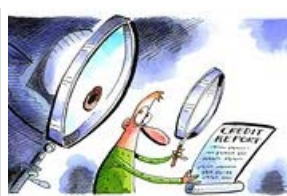
10 things credit bureaus won't say