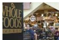
At Whole Foods, Low Prices Mean Trouble in Aisle 2