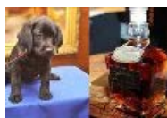
Five Things Harder to Buy Than Guns