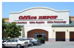
OfficeMax, Office Depot mull merger: WSJ