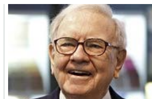
Buffett unleashes the ultimate Wall St. racket