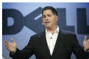
Dell in a tight spot with results on deck