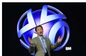
Sony may step up its game with PlayStation 4